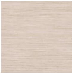
ASR01-010 MAPLE SUGAR