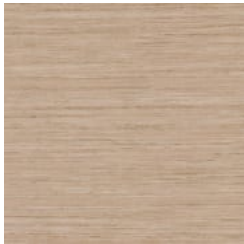
ASR01-520 WINTER GOLD