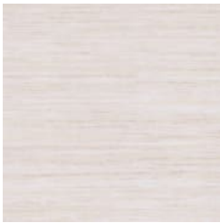
ASR01-003 PACIFIC PEARL