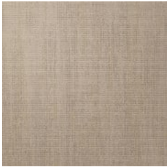
A 199-118 BARBARY SAND