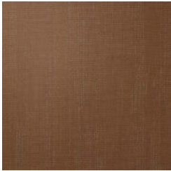
A199-402 CASA DE ORO