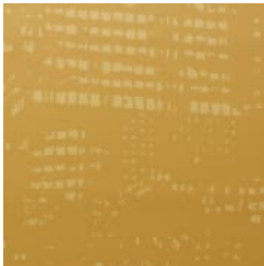
ASL 161749 AUSTIN