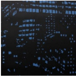
ASL-161336 NEW YORK