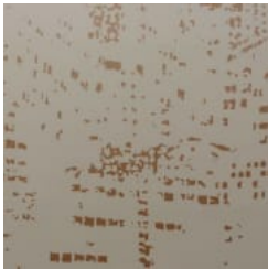
ASL 161966 LOS ANGELES