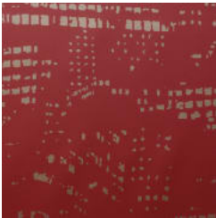
ASL-161410 SAN FRANCISCO