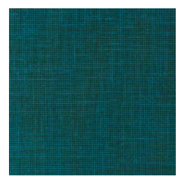
W2-TG-03 BLUE GALAXY