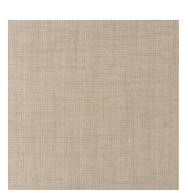
W2-TG-14 TRANQUIL TAUPE