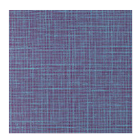
W2-TG-02 MAGENTA SURPRISE