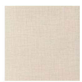
W2-TG-16 CHAMPAGNE ET CREME