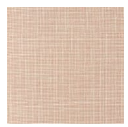
W2-TG-23 SALMON BEURRE