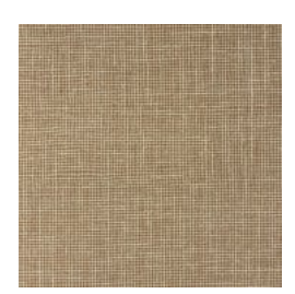
W2-TG-18 ICING ON THE CAKE