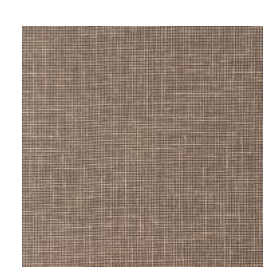
W2-TG-21 BLUSHING BLACK