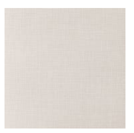
W2-TG-13 BAD TO THE BONE