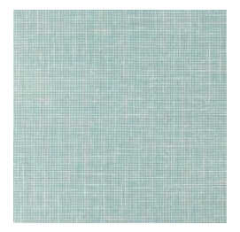
W2-TG-05 KAINDY TEAL