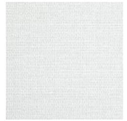
W2-GN-04 BARELY THERE