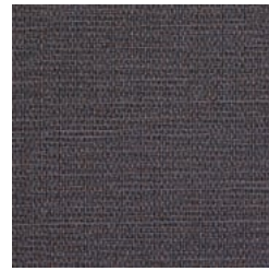
W2-GN-03 MOROCCAN NIGHT