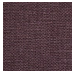
W2-GN-24 WILD FLOWER