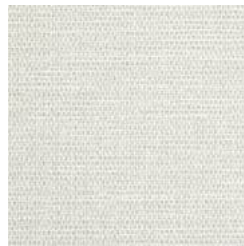
W2-GN-07 FEATHER WHITE