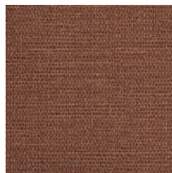
W2-GN-23 SUNLIT COPPER