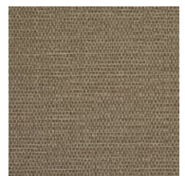
W2-GN-20 AZTEC BROWN