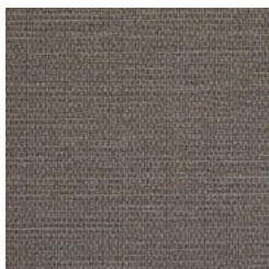
W2-GN-21 FRENCH TOAST