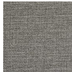
W2-GN-08 VINTAGE STERLING