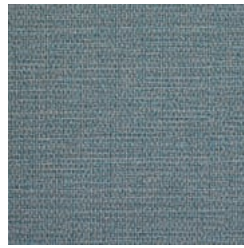
W2-GN-02 RENDEZ- BLUE