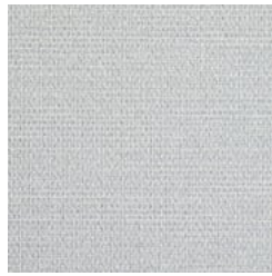
W2-GN-01 SILVER SURF