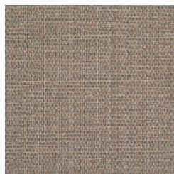
W2-GN-22 TRANSCEND TAN