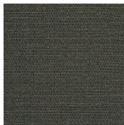
W2-GN-12 MYSTIC BLACK