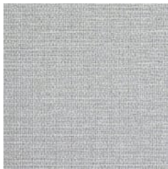
W2-GN-05 EXOTIC GREY