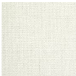
W2-GN-10 MELLOW WHITE