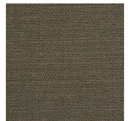
W2-GN-15 ANTIQUE MOSS