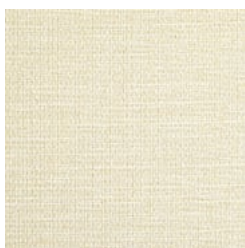
W2-GN-16 MARRAKESH SAND