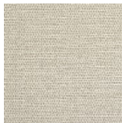
W2-GN-13 TRIBAL TAN