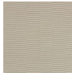
W2-ST-08 SOLID PEWTER