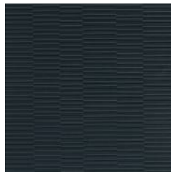
W2-ST-06 NIGHT BLUE