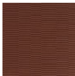
W2-ST-17 RUSTY RED