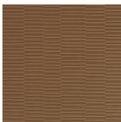
W2-ST-15 AGED BRONZE