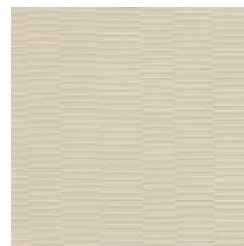
W2-ST-13 FAIRY DUST