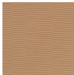
W2-ST-12 MAUVE QUARTZ