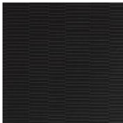
W2-ST-03 BLACK LACQUER