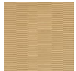
W2-ST-14 AZTEC GOLD