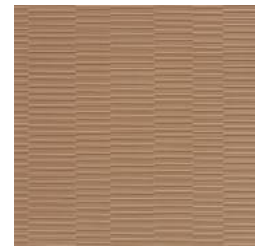
W2-ST-09 SHEER TAUPE