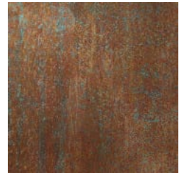
A170-697 RUSTED COPPER