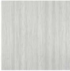
BB-WK-01 GOOD WHITE-CH