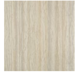
BB-WK-04 DANDY LION