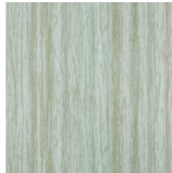
BB-WK-07 OZ DUST