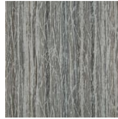
BB-WK-03 NIGHT BIRCH