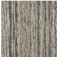
BB-WK-06 BLACK OAK