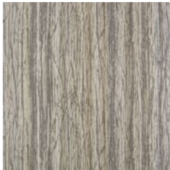
BB-WK-05 TOTO- AUPE