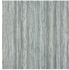
BB-WK-02 TIN MAN