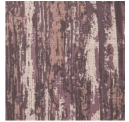
A176-333 ROCK STAR