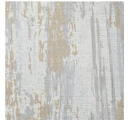
A176-852 STONE WASH