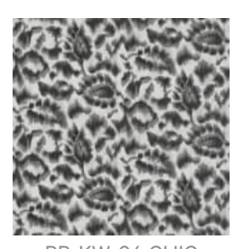
BB-KW-04 CHIC BLACK