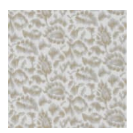
BB-KW-02 GOLDEN GREY