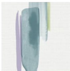
AZ53660 WELLNESS WHITE