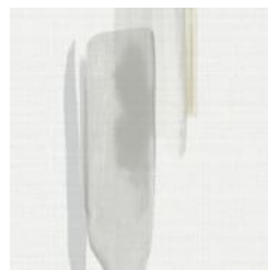
AZ53662 NEUTRAL WHITE