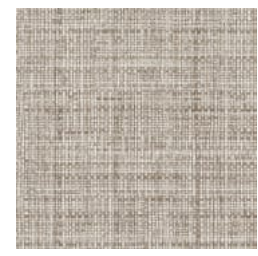
AZ53721 WOVEN WHEAT