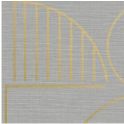
AZ53696 WILD BREEZES