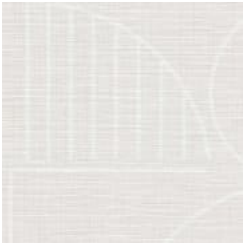
AZ53695 BEYOND PALE