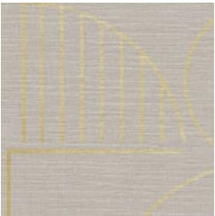
AZ53699 INTO THE MYSTIC