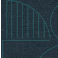
AZ53697 INTO THE NAVY