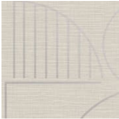
AZ53698 HALL OF FAME