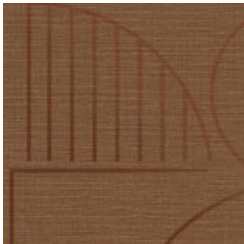
AZ53703 SAINT DOMINIC