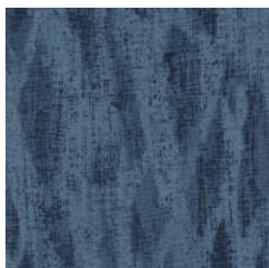
SG15-06 NIGHT LIFE