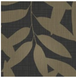
MIDNIGHT GLOW BB-WX-04