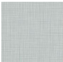
BLUE JAY BB-WW-15