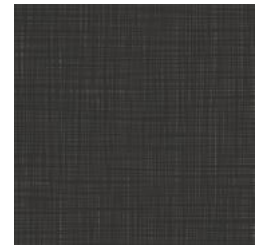
MIDNIGHT GLOW BB- WW-04