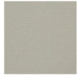
FOS 53 FILTER