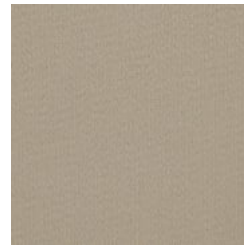
FOS 52 NATURAL