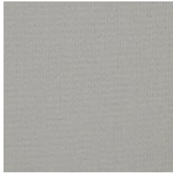
FOS 54 OVERCAST