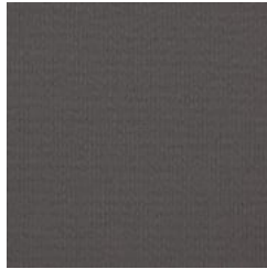
FOS 56 CARBON