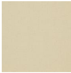
FOS 51 ECRU