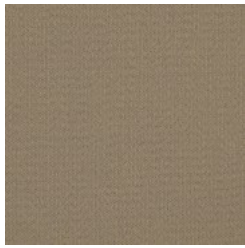
FOCUS FOS 50 SEPIA