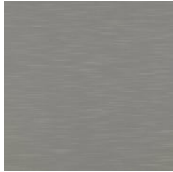
STL 28 VIEW POINT