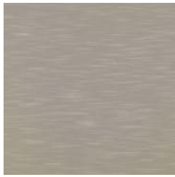
STL 21 SCAN