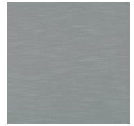
STL 25 HORIZON