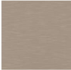
STL 26 VISTA