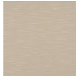
STL 23 CASHMERE