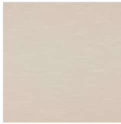
STL 22 PERSPECTIVE