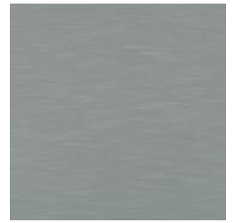
STL 25 HORIZON