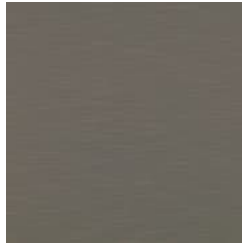
STL 29 CLEAR VIEW