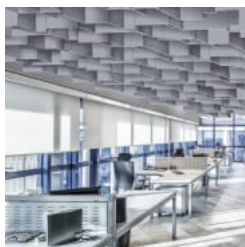
Baffle Connect Rise High