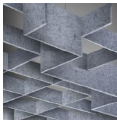
Baffles Connect Rise Detail in Cadet