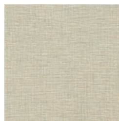
FLA 52 BUNGALOW