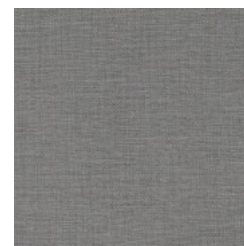
FLA 63 SLATE