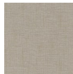
FLA 58 COCONUT