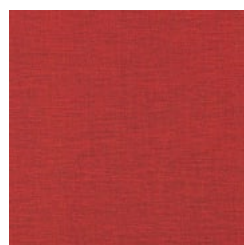
FLA 67 SALSA