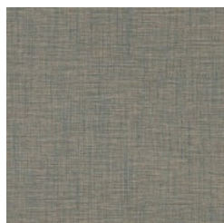
FLA 59 TIKI