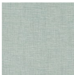
FLA 61 SEASIDE