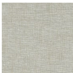
FLA 56 SHORE