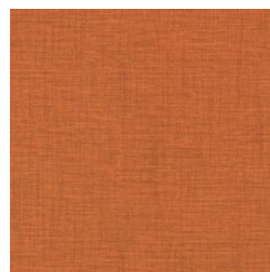
FLA 62 RUM