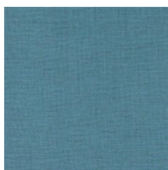
FLA 71 BERMUDA