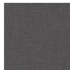
FLA 68 CHARCOAL