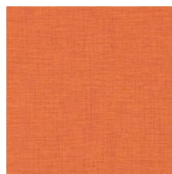
FLA 57 LIFESAVER