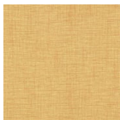
FLA 55 GINGER