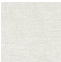
FLA 51 COVE