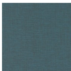
FLA 70 VOYAGE