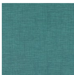
FLA 66 POLYNESIA