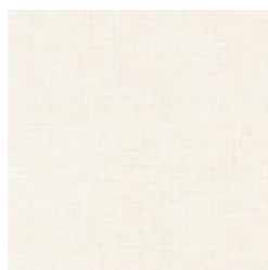
FLA 50 SHELL