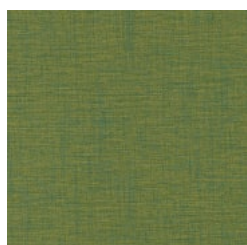
FLA 65 HULA