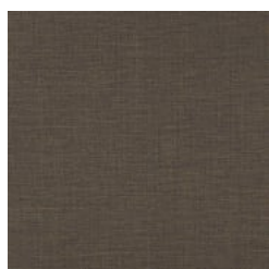
FLA 69 COCOA