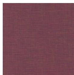
FLA 72 SUGAR BEET