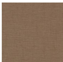
FLA 64 DATE