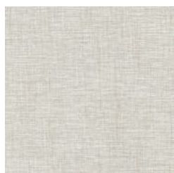
FLA 54 FOSSIL