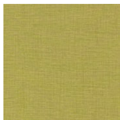
FLA 60 GECKO