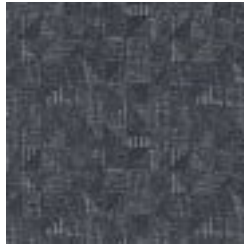
65861 BLUE PRINT