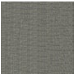
9006 BATTLESHIP GREY