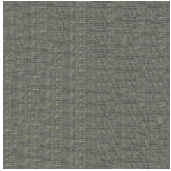
9006 BATTLESHIP GREY