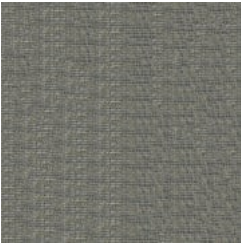
9006 BATTLESHIP GREY