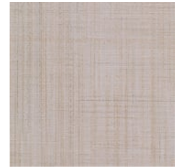
ASR04-560 PARK VIEW