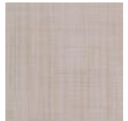
ASR04-560 PARK VIEW