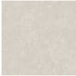
P3T-60331 STONE AGE