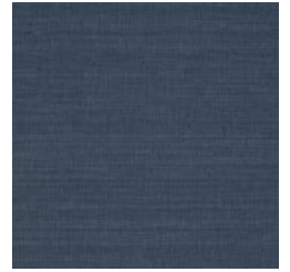
MDV1084 PETROL BLUE