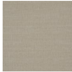
MDV1086 CREME BRULEE