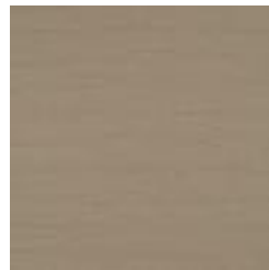
MDV2028 FRENCH HORN