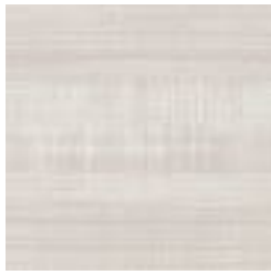
P3T-60311 TAROUDANT SLAB