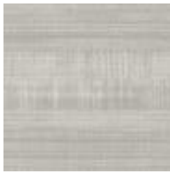
P3T-60316 RAMADY PUMICE