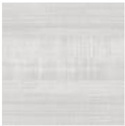
P3T-60315 SALE GRAVEL