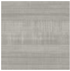
P3T-60310 TAZA BEDROCK