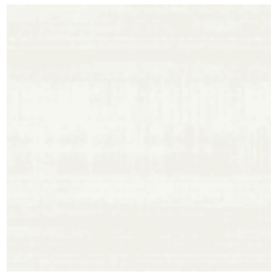
P3T-60312 ROYAL ALABASTER