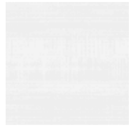
P3T-60314 WHITE QUARTZ