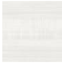
P3T-60313 PEBBLE ALLEYWAY