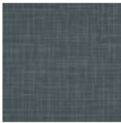
MDV1001 DARK TEAL