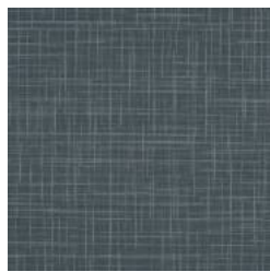
MDV1001 DARK TEAL