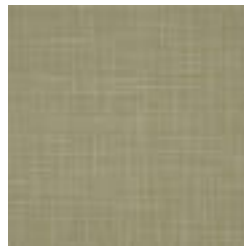
MDV1007 TEA LEAF