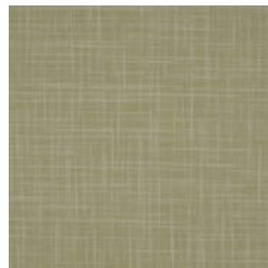
MDV1007 TEA LEAF