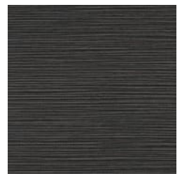
MDV2005 RIVER ROCK