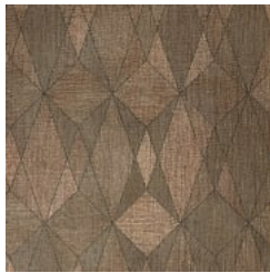
A204-581 SHALE (MYLAR)