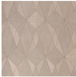
A204-522 TWILIGHT (MYLAR)