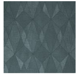
A204-323 BLUE MOON (MYLAR)