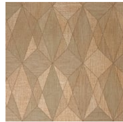
A204-775 GOLD (MYLAR)