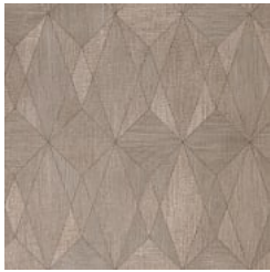
A204-519 SUMMIT (MYLAR)