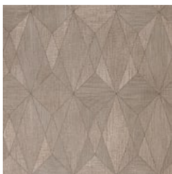
A204-519 SUMMIT- MYLAR