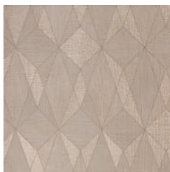
A204-522 TWILIGHT- MYLAR