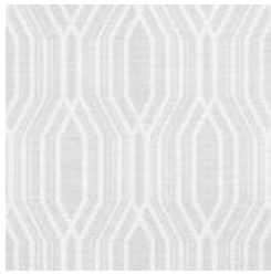
BB-BG-01 WATER LILY