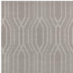
BB-BG-06 STONE CARVING