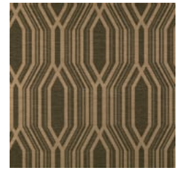
BB-BG-04 ARABICA BEAN