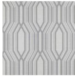
BB-BG-02 RICE FIELD