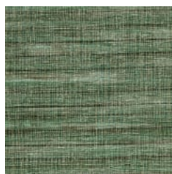
AZ53111 LUSH FOREST