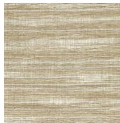
AZ53107 SAND BAR