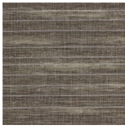
AZ53100 DRAGON TREE