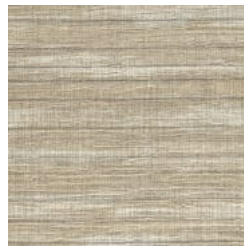
AZ53102 MACADAMIA NUT