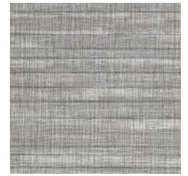
AZ53099 SILVER SURFER