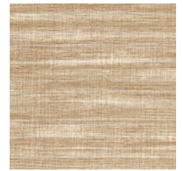
AZ53104 GOLDEN MIMOSA