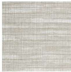
AZ53101 SUGAR CANE