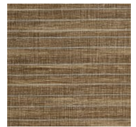
AZ53109 COCONUT HUSK