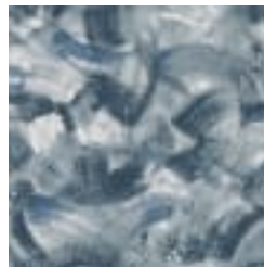
SG02-07 PRUSSIAN BLUE