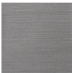
ASL-139845 STORM CLOUD