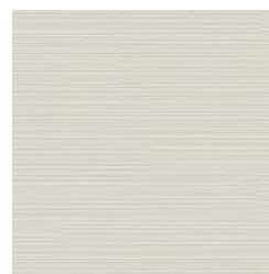
ASL-139156 EGG SHELL