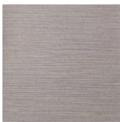
ASL-139800 BEACH FOG

Wallcoverings » Commercial Wallcoverings