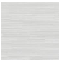
ASL-139012 SEA SALT