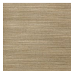
ASL-139774 MUSTARD SEED