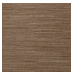
ASL-139503 COFFEE BEAN