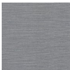
ASL-139531 EARL GREY