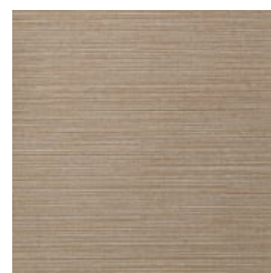
ASL-139569 CORAL SAND