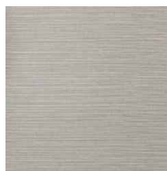
ASL-139892 SILVER LEAF