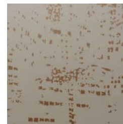
ASL 161966 LOS ANGELES