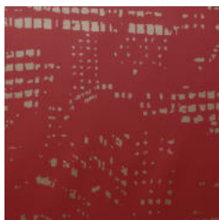
ASL-161410 SAN FRANCISCO