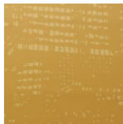
ASL 161749 AUSTIN