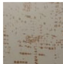
ASL 161966 LOS ANGELES