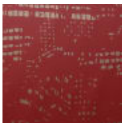
ASL-161410 SAN FRANCISCO