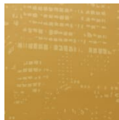
ASL 161749 AUSTIN