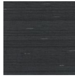
W2-MU-03 BLACK NOIL