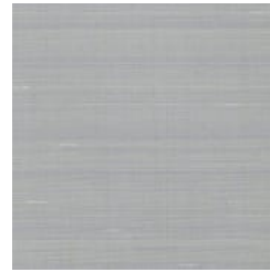
W2-MU-08 SATIN SKY