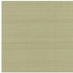
W2-MU-05 JADE GATE