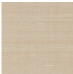
W2-MU-17 GOBI DESERT