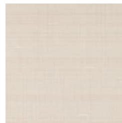
W2-MU-19 AGED IVORY