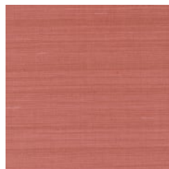
W2-MU-23 TIGER LILY