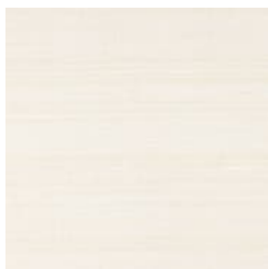
W2-MU-16 COCOON CREAM