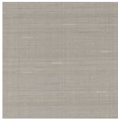
W2-MU-11 SILVER SILK