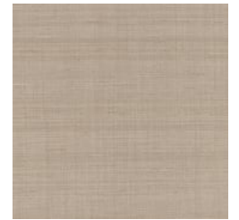
W2-MU-14 RAW SILK