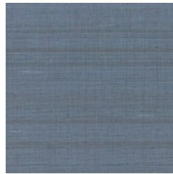
W2-MU-12 DUCHESS BLUE