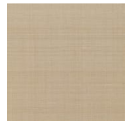
W2-MU-20 GUAN GOLD