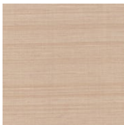
W2-MU-22 TUSSAH TAN