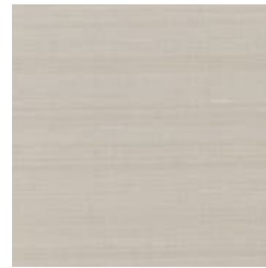
W2-MU-13 NEUTRAL TINT