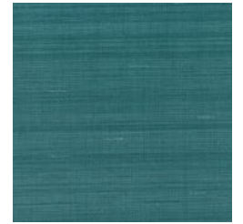
W2-MU-09 TAFFETA TEAL