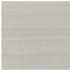
W2-MU-10 GAUZE GRIS