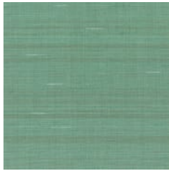
W2-MU-06 ERI EMERALD