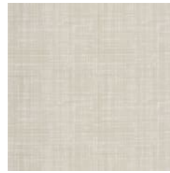
W2-PH-03 SANDY PEARL