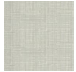
W2-PH-04 SINCERE SAGE