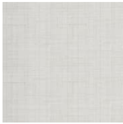
W2-PH-01 NOTES OF VANILLA