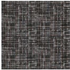
W2-PH-06 MIDNIGHT RUN