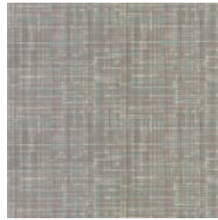
W2-PH-07 MINKY MINT