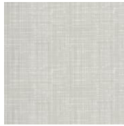
W2-PH-02 SMOKY LUSTER