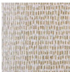
W2-RE-02 LAKE GREEN