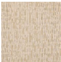
W2-RE-06 HIGH-END BEIGE