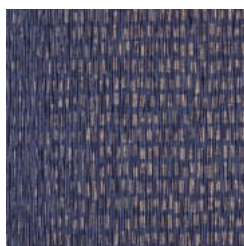
W2-RE-12 NYC NIGHT