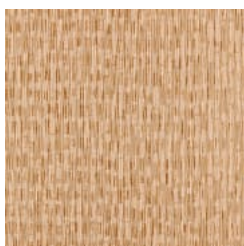
W2-RE-10 GOLD ON GOLD