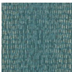
W2-RE-11 FOREST LIGHT