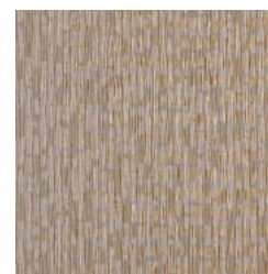
W2-RE-04 GOLDEN OLIVE