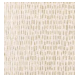
W2-RE-09 BONE CHINA