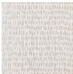
W2-RE-05 CREAM WHITE