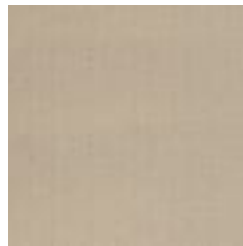
W2-SD-07 SANDY TWIST