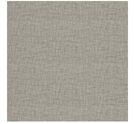
W2-SD-04 CINDER SKETCH