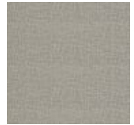
W2-SD-04 CINDER SKETCH