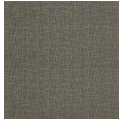
W2-SD-02 SLATE SWIVEL