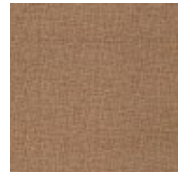
W2-SD-09 HOT COCOA