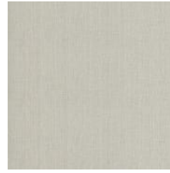
W2-SD-03 WINTER FROST