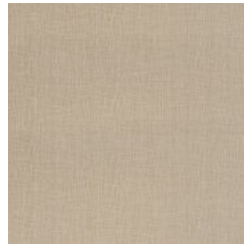
W2-SD-07 SANDY TWIST