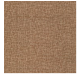
W2-SD-09 HOT COCOA