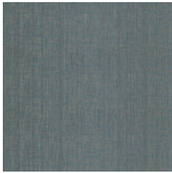
W2-SD-05 CARBON WAVE