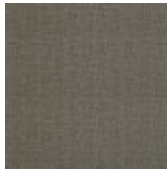
W2-SD-02 SLATE SWIVEL