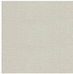
W2-SD-06 CLOUDY DOODLE