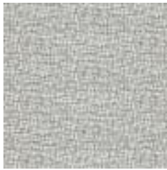
W2-SD-01 CLOUDY INK