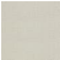
W2-SD-06 CLOUDY DOODLE