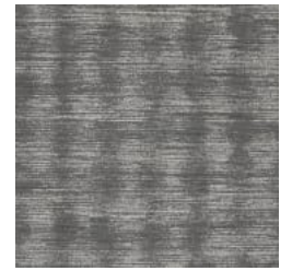
BB-RB-04 ELECTRONIC EVENING