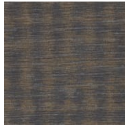
BB-RB-08 DARK DISCO