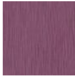
W2-UF-03 PLUM SPARKLE