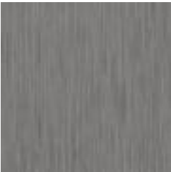
W2-UF-07 SKYLINE SPARKLE