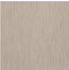
W2-UF-02 LATTE SPARKLE