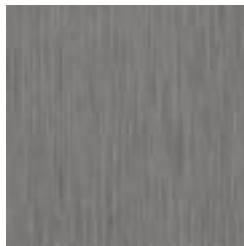
W2-UF-07 SKYLINE SPARKLE