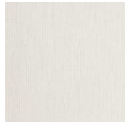
W2-UF-04 WHITE SPARKLE