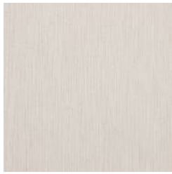
W2-UF-01 OYSTER SPARKLE