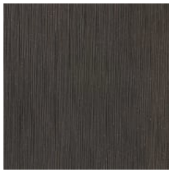
W2-UF-06 NIGHTLIFE SPARKLE