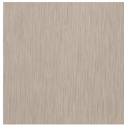
W2-UF-02 LATTE SPARKLE