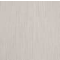
W2-UF-05 CITY SPARKLE