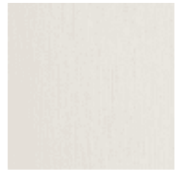
W2-UF-04 WHITE SPARKLE