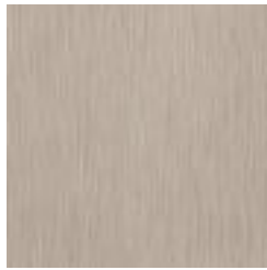
W2-UF-02 LATTE SPARKLE