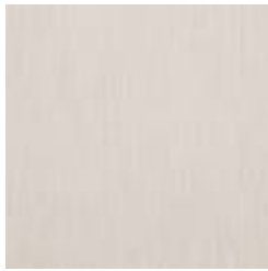
W2-UF-01 OYSTER SPARKLE