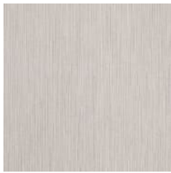
W2-UF-05 CITY SPARKLE