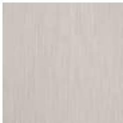
W2-UF-05 CITY SPARKLE