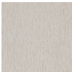
AZ52896 GILDED LILY