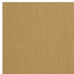
AZ52267 TAJ MAHAL