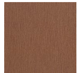
AZ52269 COPPER WIRE