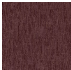
AZ52897 GOLDEN PLUM