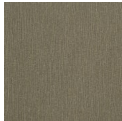
AZ52261 PINE NEEDLE