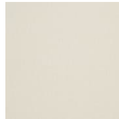
AZ52262 ANNETTE LACE