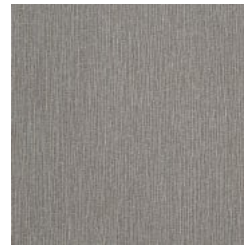
AZ52252 SHEET METAL