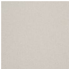
AZ52259 ECO LINEN