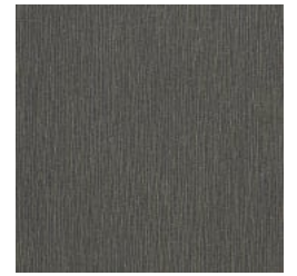
AZ52253 CELINE BLACK