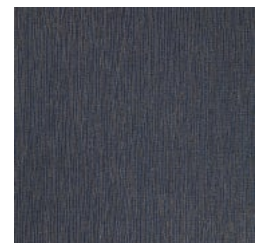
AZ52899 ROYAL NAVY