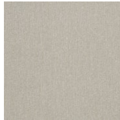
AZ52256 SATIN BARK