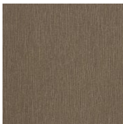
AZ52265 KONA GOLD