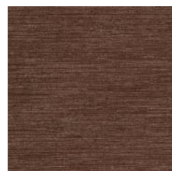
AZ53093 BASS GUITAR