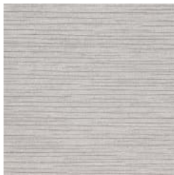
AZ53075 PLATINUM HITS