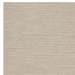
AZ53083 FORT HOOD