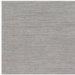
AZ53076 STAGE GREY