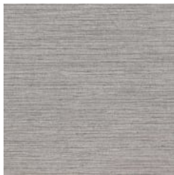
AZ53076 STAGE GREY