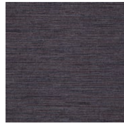
AZ53073 BLUE SUEDE