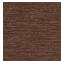
AZ53093 BASS GUITAR