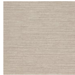
AZ53083 FORT HOOD