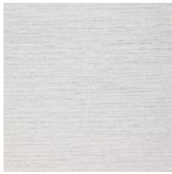
AZ53070 WHITE MELODY