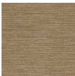
AZ53085 ARMY BRASS