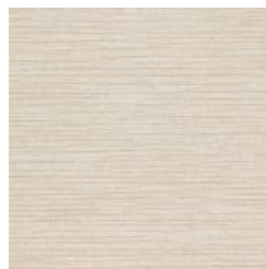
AZ53082 TUPELO CREAM