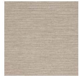
AZ53084 KING KHAKI