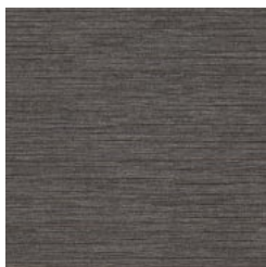
AZ53081 ROCK LEGEND