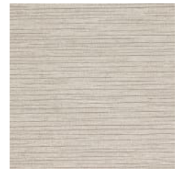
AZ53079 BEIGE SPINOUT