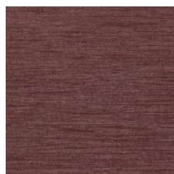
AZ53092 PRISCILLA PLUM