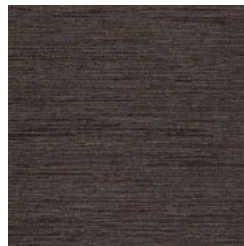
AZ53077 VEGAS NIGHTS