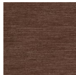
AZ53093 BASS GUITAR