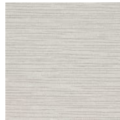
AZ53078 PRESLEY PEARL