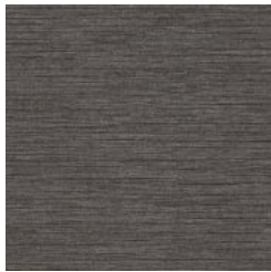
AZ53081 ROCK LEGEND