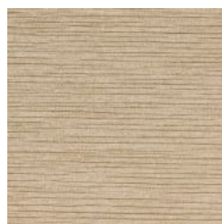
AZ53087 BRIGHT LIGHTS