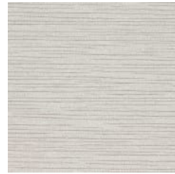
AZ53078 PRESLEY PEARL