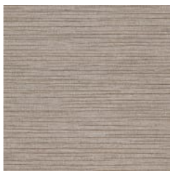
AZ53080 TV TAUPE