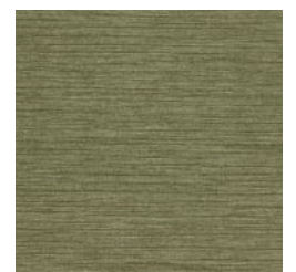
AZ53089 DRAFTED GREEN