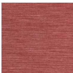
AZ53091 SCARLET SWAY