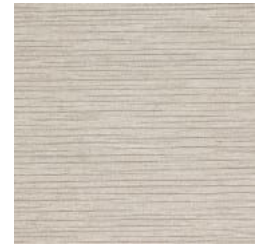
AZ53079 BEIGE SPINOUT