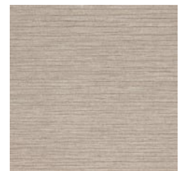
AZ53084 KING KHAKI