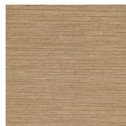
AZ53088 GOLD RECORD