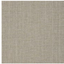
BB-WS-07 GREY LOAFERS