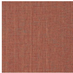
BB-WS-12 FIERY CRIMSON