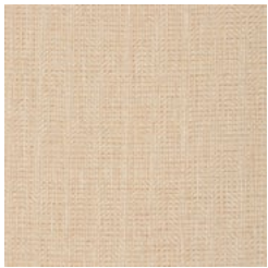
BB-WS-10 TAILOR- MADE