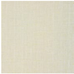
BB-WS-05 FRENCH CUFFS