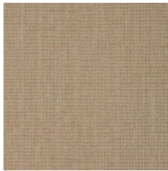
BB-WS-11 TRENCH COAT