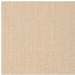
BB-WS-10 TAILOR- MADE