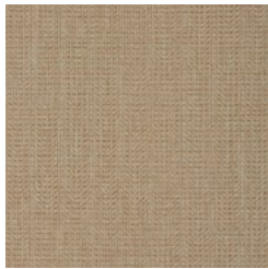
BB-WS-11 TRENCH COAT