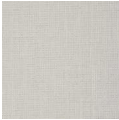
BB-WS-01 POLISHED WHITE