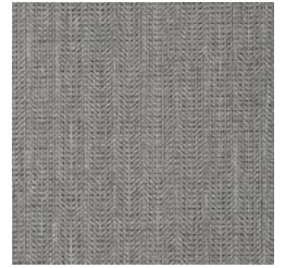
BB-WS-04 BLACK TIE