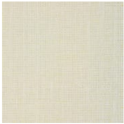
BB-WS-05 FRENCH CUFFS