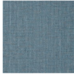
BB-WS-03 BLUE COLLAR