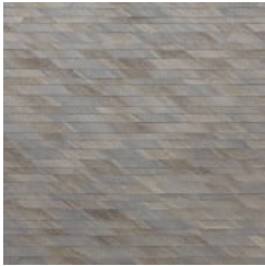
JUA103 WARM SILVER