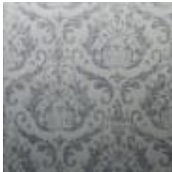
EGA1689 NAVYBLUE/ GREY