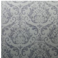
EGA1689 NAVYBLUE/ GREY