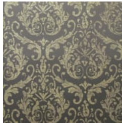
EGA1780 MERCURY/ GOLD