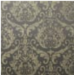
EGA1780 MERCURY/ GOLD