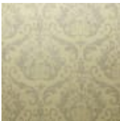
EGA1488 GOLDEN YELLOW