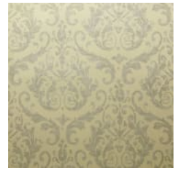
EGA1488 GOLDEN YELLOW