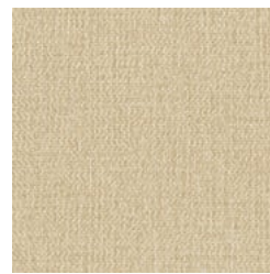
CRL 33 MACADAMIA