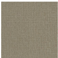
CRL 32 MOREL