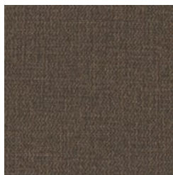
CRL 36 TRUFFLE