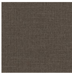
CRL 37 CHARCOAL