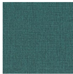
CRL 34 JASPER