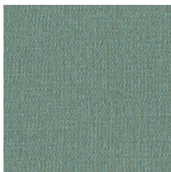
CRL 30 SURF