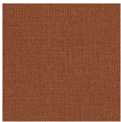
CRL 35 AMBERGLOW

Fabrics » Vinyl and Faux Leather Fabrics