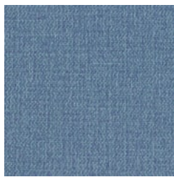
CRL 31 DELPHINIUM