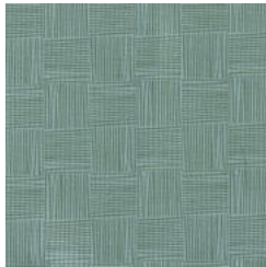
VH002408 SILVER LINING