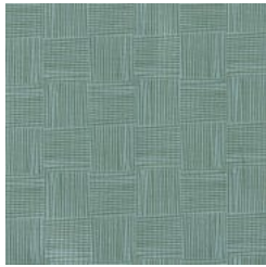
VH002408 SILVER LINING