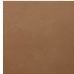
SEA-859 LT COPPER