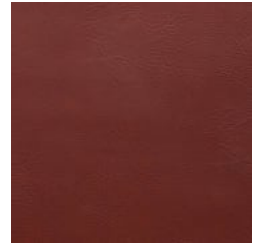
SEA-863 REEL RED