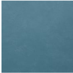
SEA-856 BERMUDA BLUE