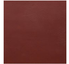
SEA-863 REEL RED