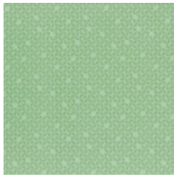
155 DUCK EGG